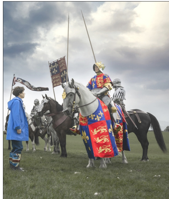
A scene from 'The Lost King', the new movie about the quest to discover the final resting place of Richard III

Finally, discuss with your class the subject of 'age limits' for certain films, especially those containing scenes of realistic violence. Much of what we are allowed to see and hear is regulated by our governments. But are current movie age limits good enough? Or are too many very young people exposed to film violence that could disturb their mental well-being?